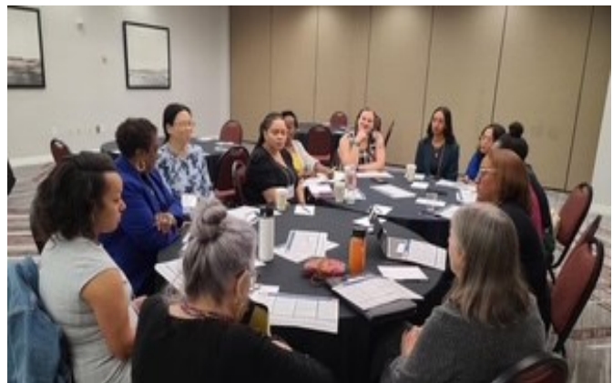
RWE Las Vegas, 2024

The opportunity to present papers at summer writing workshops and specialized conferences for principals and assistant principals further enriched my professional repertoire. These gatherings often spotlight issues relevant to Texas women in higher education, allowing for dialogue and collaboration among attendees. One highlight was the Texas Council of Women School Executives Spring Conference, where I shared my insights on leadership and empowerment in educational settings.