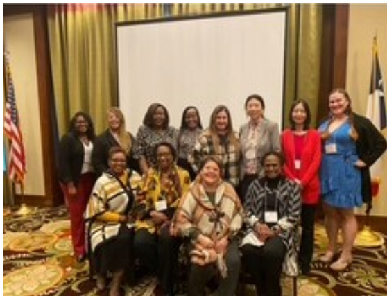
RWE Houston, 2022

My journey began with participation in critical conversation webinars hosted by the Research on Women and Education organization. These platforms allow for meaningful discussions about the challenges and successes faced by women in educational leadership, providing a space for everyone to share their insights and experiences. Additionally, being a guest speaker at the TASA Midwinter Conference in Austin, Texas, enabled me to engage directly with fellow educators and administrators, sharing innovative strategies for fostering inclusive educational environments.